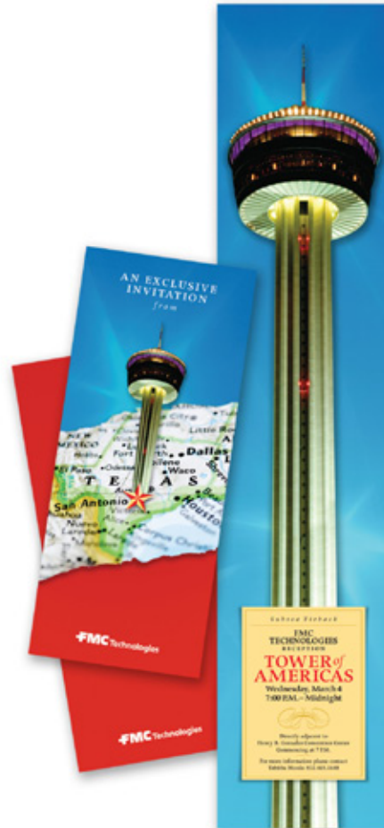
FMC Technologies: 2009 Subsea Tieback Invitation