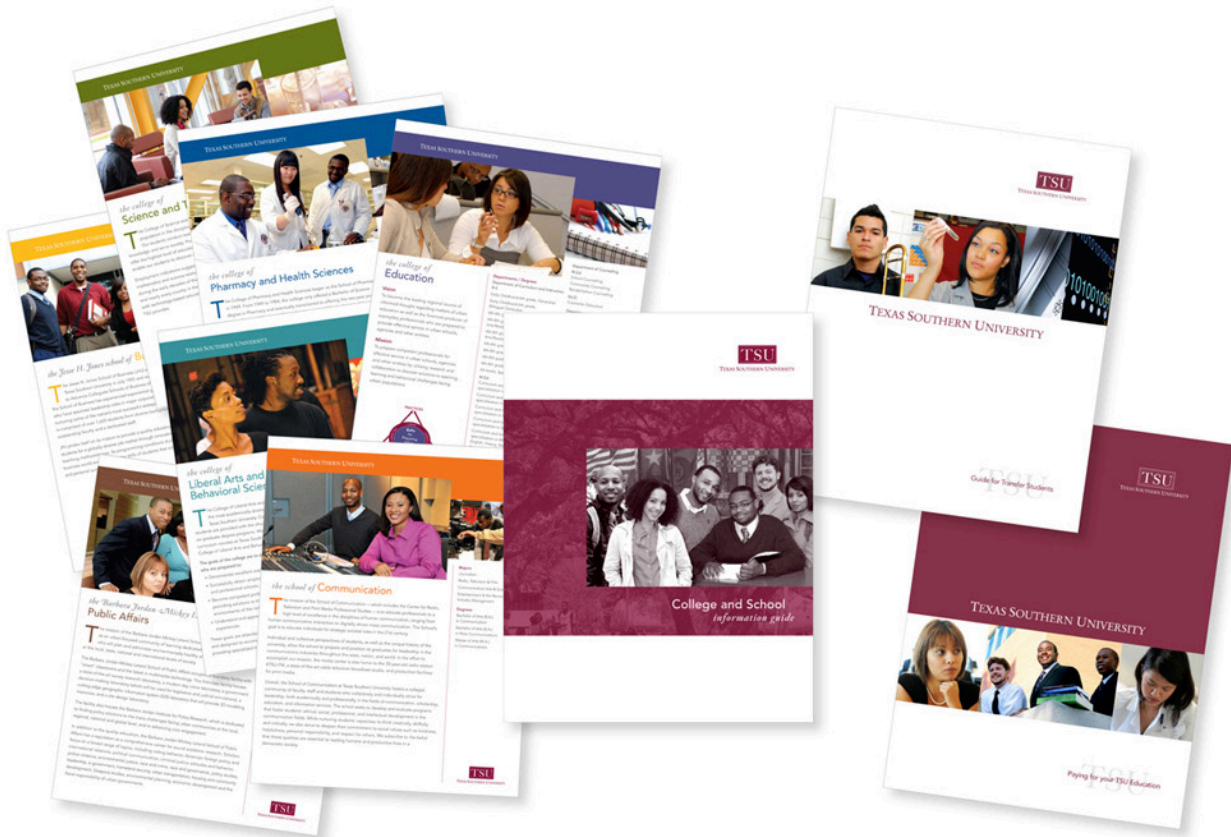
Texas Southern University: Marketing Brochures