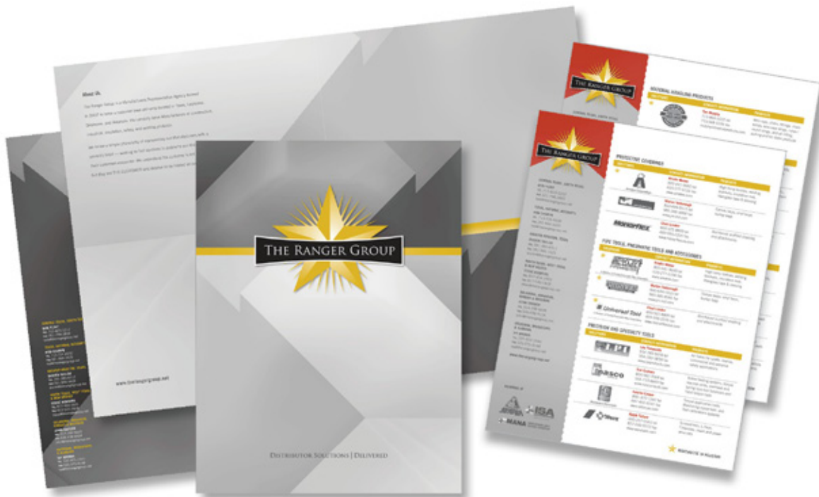
The Ranger Group: Pocket Folder & Insert