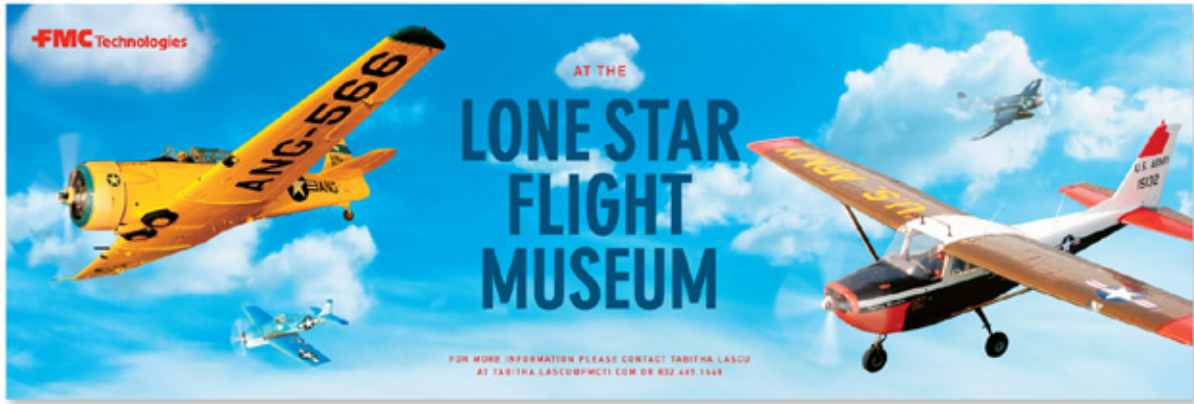
FMC Technologies: 2012 Subsea Tieback Invitation