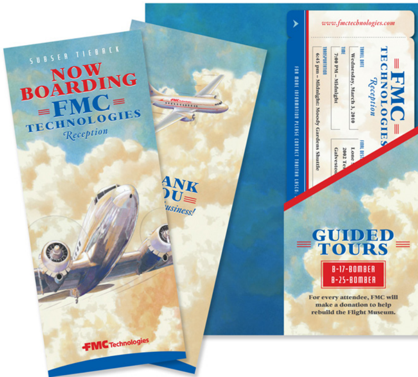
FMC Technologies: 2010 Subsea Tieback Invitation